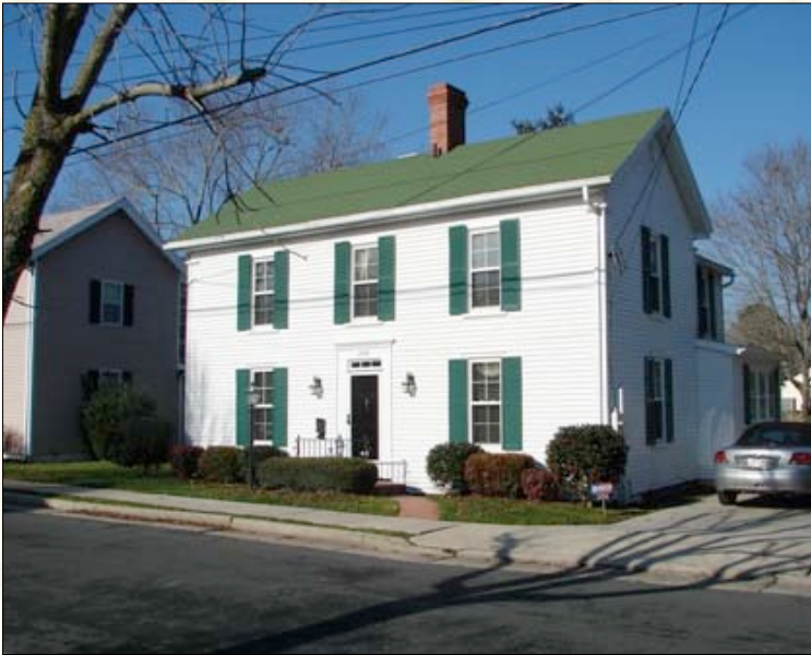
Cute eh? The living room with a fireplace is to the right of the front door; my office is on the left. It's got central air, modern appliances, lots of light and great vibes!