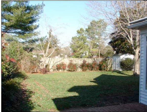
Here is the back garden, just enough to putter in. I even have an "official" potting shed! It's winter here, but I can hear all the beautiful flowers resting up for a brilliant display come spring!

Yep, that's a huge garden room waiting patiently to host my HeartArt classes! The kitchen/laundry room is in the center of the house (peeking out behind the garden room).